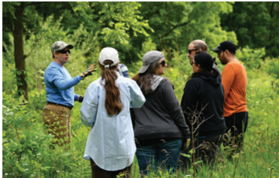
PHOTO: There are many benefits to volunteering with the District. You engage in some physical activity while meeting like-minded people. And you help improve Will County's preserves, which enhances the quality of life for all residents.