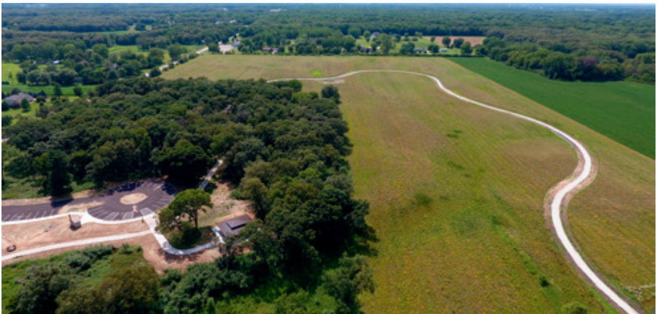
PHOTO: Kankakee Sands Preserve protects savanna and wetland habitat. A unique feature of the site is its sand dunes and savanna.