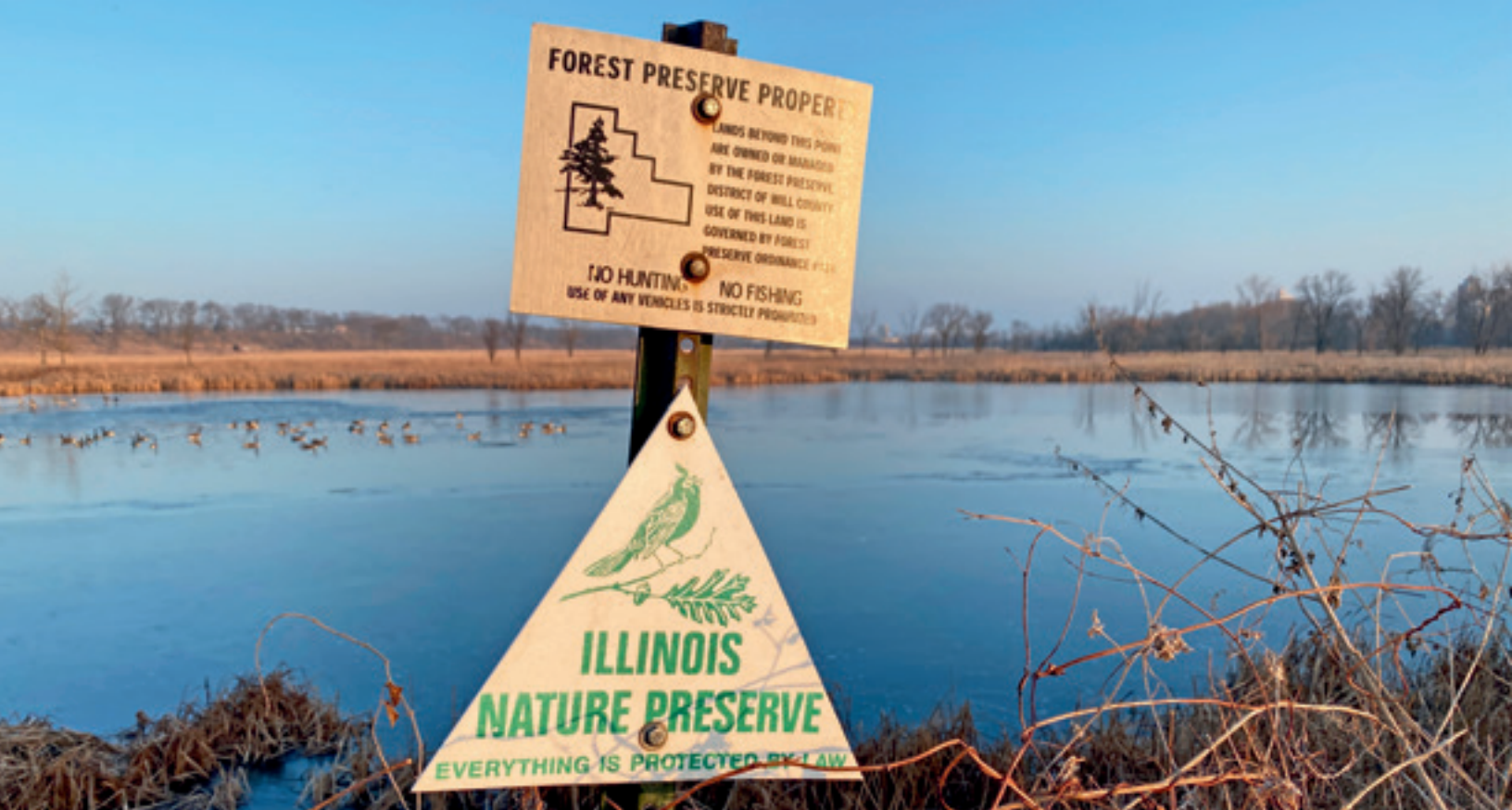
PHOTO: Lockport Prairie Nature Preserve protects a diversity of habitats, including forest, prairie, savanna, wetland and a portion of the Des Plaines River.