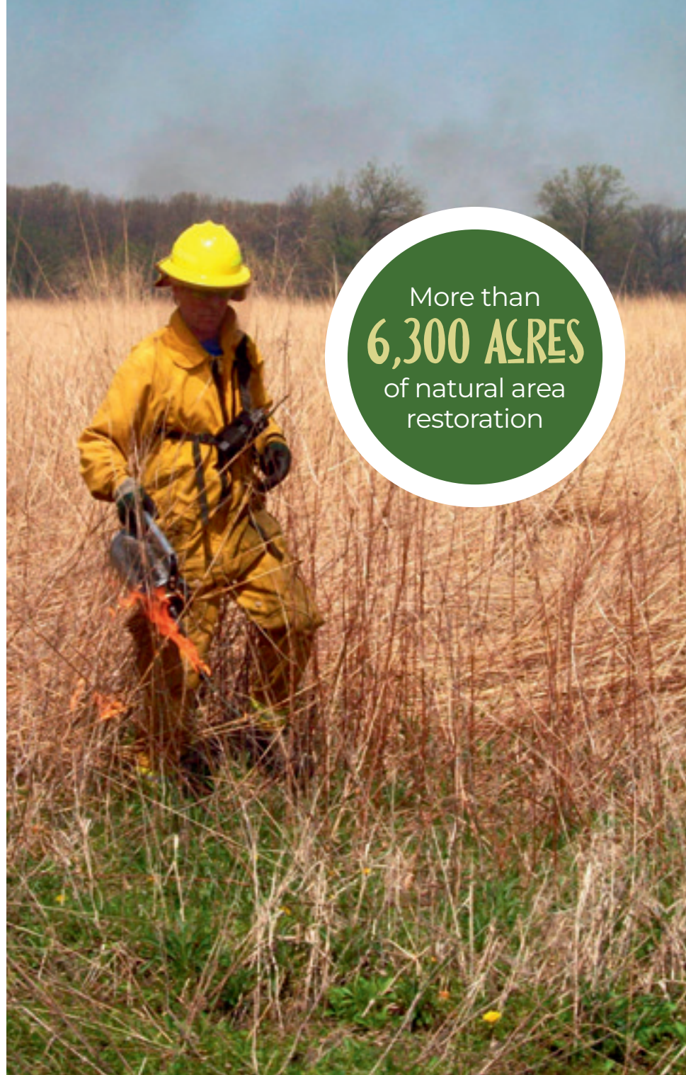
PHOTO: Controlled burning requires extensive planning, training, personnel and equipment. Planning is often underway six months or more prior to implementation.

Forest Preserve staff and volunteers collected more than 490 pounds of seed from 177 different native plant species in 2022. These seeds will be used to establish native plant communities in newly restored areas and to enrich degraded natural areas.