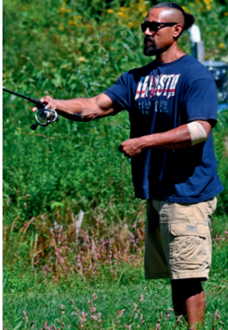
PHOTO: Fishing programs are offered seasonally at select forest preserves.