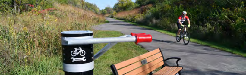
∧ The bicycle repair station along Hickory Creek Bikeway.