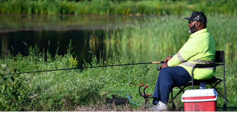
★ Fishing programs are offered seasonally at select preserves.